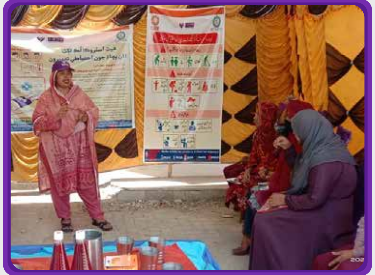
HEATWAVE SESSION IN DADU BY (FRDP)

The Fast Rural Development Program is taking proactive measures to mitigate the impact on vulnerable communities in Sindh. FRDP activated its Emergency Response Team (ERT) immediately. The program team was tasked with focusing on Dadu, Hyderabad, Mirpurkhas, Khairpur Mir's, Umerkot, and Tharparkar Districts. The team decided to run awareness campaigns and focus on educating people to stay hydrated, avoid outdoor activities during peak heat hours, prevent heatstroke, and establish referral mechanisms. The ERT prioritized registering orphans, arranging their health screening, and assessing their vulnerability to environmental hazards. FRDP management also prioritized areas with scarce drinking water for the provision of safe drinking solutions.